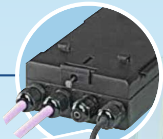
Ritmo 033 E-Box

Profibus communication box for the integration of the pump series R033 in complex Profibus-DP networks. Easy installation by plug & play between pump and sub plate and retrofitted at any time. For remote control of all setting parameters and remote monitoring of all set values and recorded fault causes.