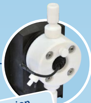
Version R033 - FC